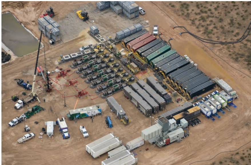
Reduced operational footprint offered by the electric-powered hydraulic fracturing fleet provides operators with wellsite space not available with a conventional fleet.

Blenders and other process equipment found on conventional fleets require personnel to perform hands-on operations, increasing their exposure to hazardous environments. However, with the electric-powered fracturing system, no personnel are required near process